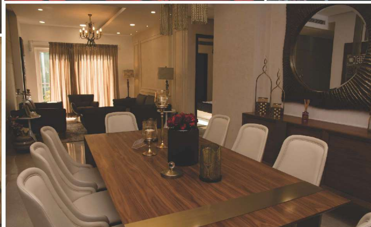
Sample Flat Pictures