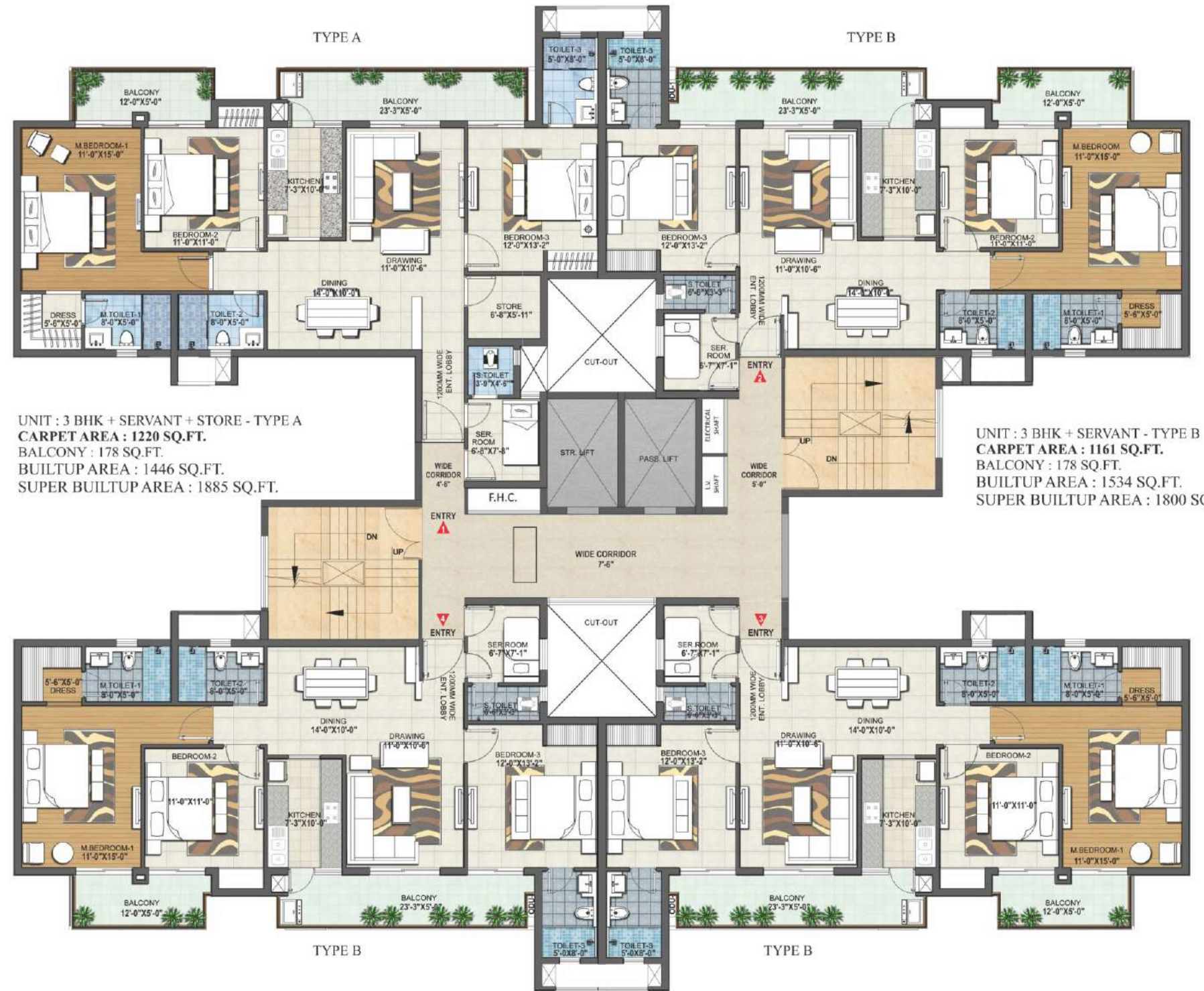
UNIT : 3 BHK + SERVANT + STORE - TYPE A CARPET AREA : 1220 SQ.FT. BALCONY : 178 SQ.FT. BUILTUP AREA : 1446 SQ.FT. SUPER BUILTUP AREA : 1885 SQ.FT.