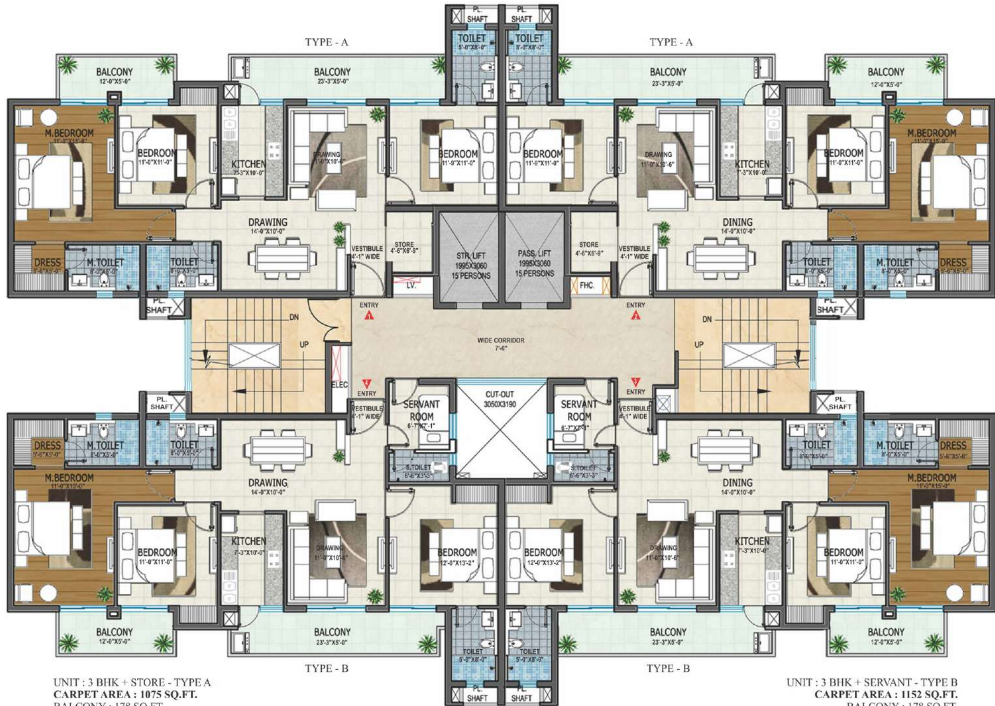
UNIT : 3 BHK + STORE - TYPE A CARPET AREA : 1075 SQ.FT. BALCONY : 178 SQ.FT. BUILTUP AREA : 1376 SQ.FT. SUPER BUILTUP AREA : 1680 SQ.FT.